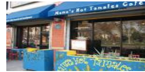
Secured Expansion Capital 2009