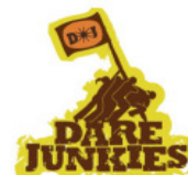
Challenge Your Friends Secured Seed Capital 2006