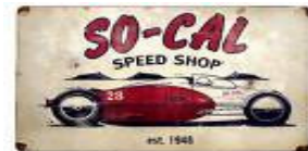
Secured Expansion Capital 2007