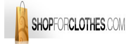
Secured Seed Capital 2008