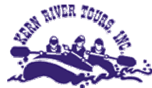
Secured Seed Capital 2007