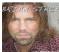
Secured Sponsorship Capital 2006